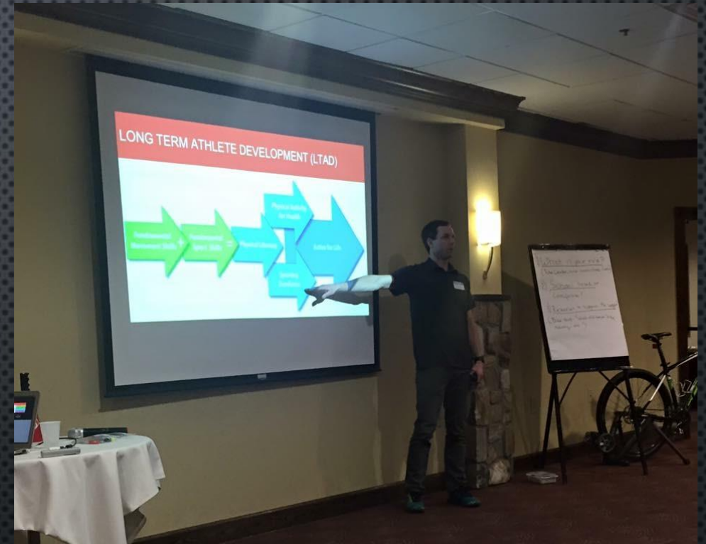
2016 PICL Leaders' Summit

We have a copy of our insurance policy if you would like to look at it as well.